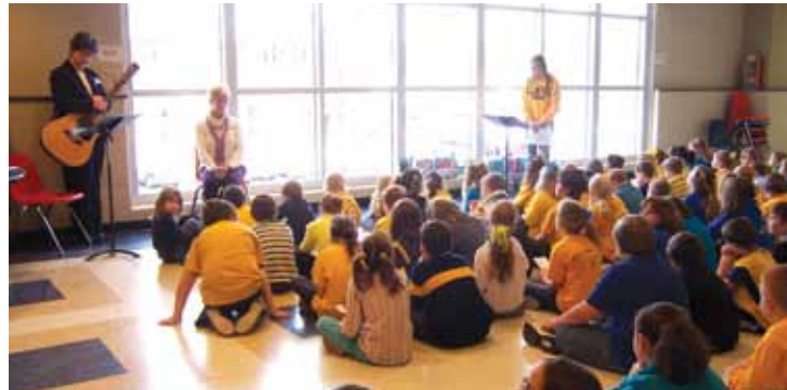
Our elementary students collected items for the local Domestic Violence Shelter. The woman from the shelter spoke to our students and there was a short prayer service for victims of violence.

For more information about Catholic Schools Week or the parish’s support of the school, call the Prince of Peace Catholic School office at 563-242-1663.