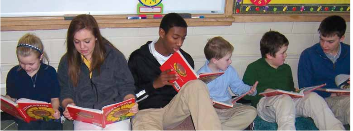
High School students help our third grade students with their reading skills.

Catholic education is truly a gift, and one that we should celebrate. That is exactly what Catholic Schools Week is all about.